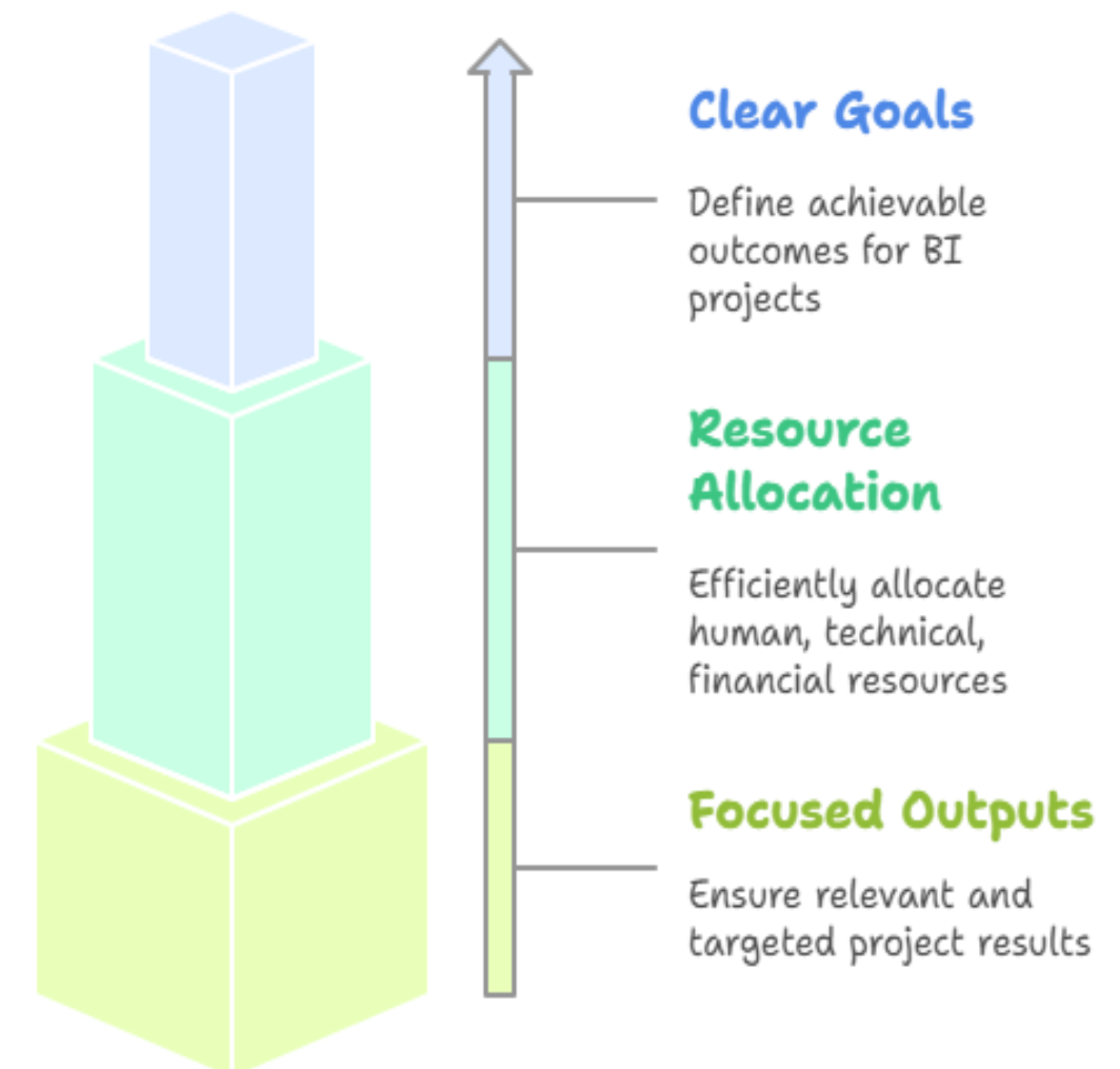
Strategic Planning Pyramid

Planning ensures that the right resources—human, technical, and financial—are allocated efficiently. It helps determine what tools, platforms, and expertise are required. Without a proper plan, organizations may either over-invest or face shortages that delay progress.