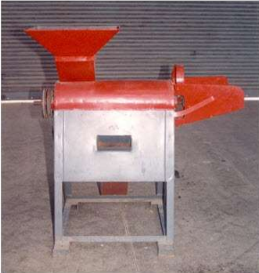
Fig. 2: Maize sheller (Power operated).