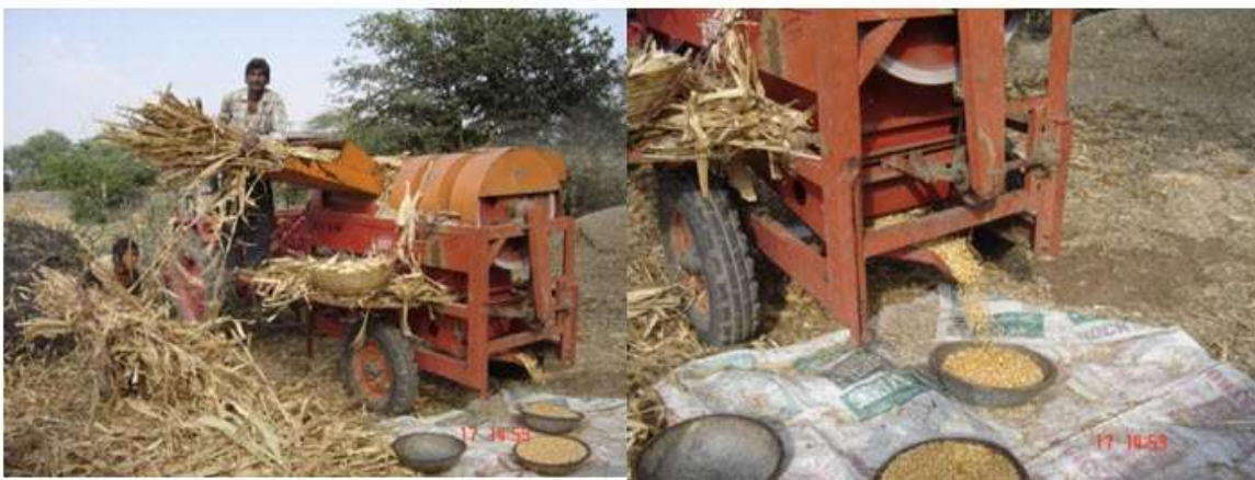
Fig. 4: The whole crop maize thresher during operation.

A whole crop maize thresher (Fig. 4) has been developed at MPUAT Udaipur with the objectives to do the shelling of maize cob and simultaneously stalk is converted to chaff. A tractor operated multi crop thresher was also modified with arrangement so of spikes on threshing cylinder and concave made of 8 mm square bar with 19 mm spacing. The output of grain was observed as 710 kg/h with chaff size of 16 to 63 mm. This chaff was fed to the animals and 85% material was consumed in comparison to the whole stalk. The significant saving in labour was found for detachment of cobs and transportation of crop from field to home. The threshing efficiency was 99% and cleaning efficiency 96.4%.