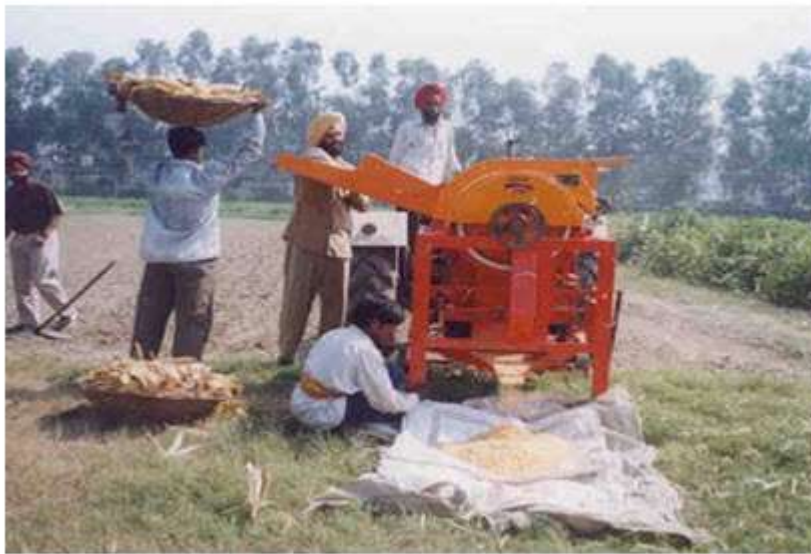
Fig. 3: Maize dehusker-sheller during operation.