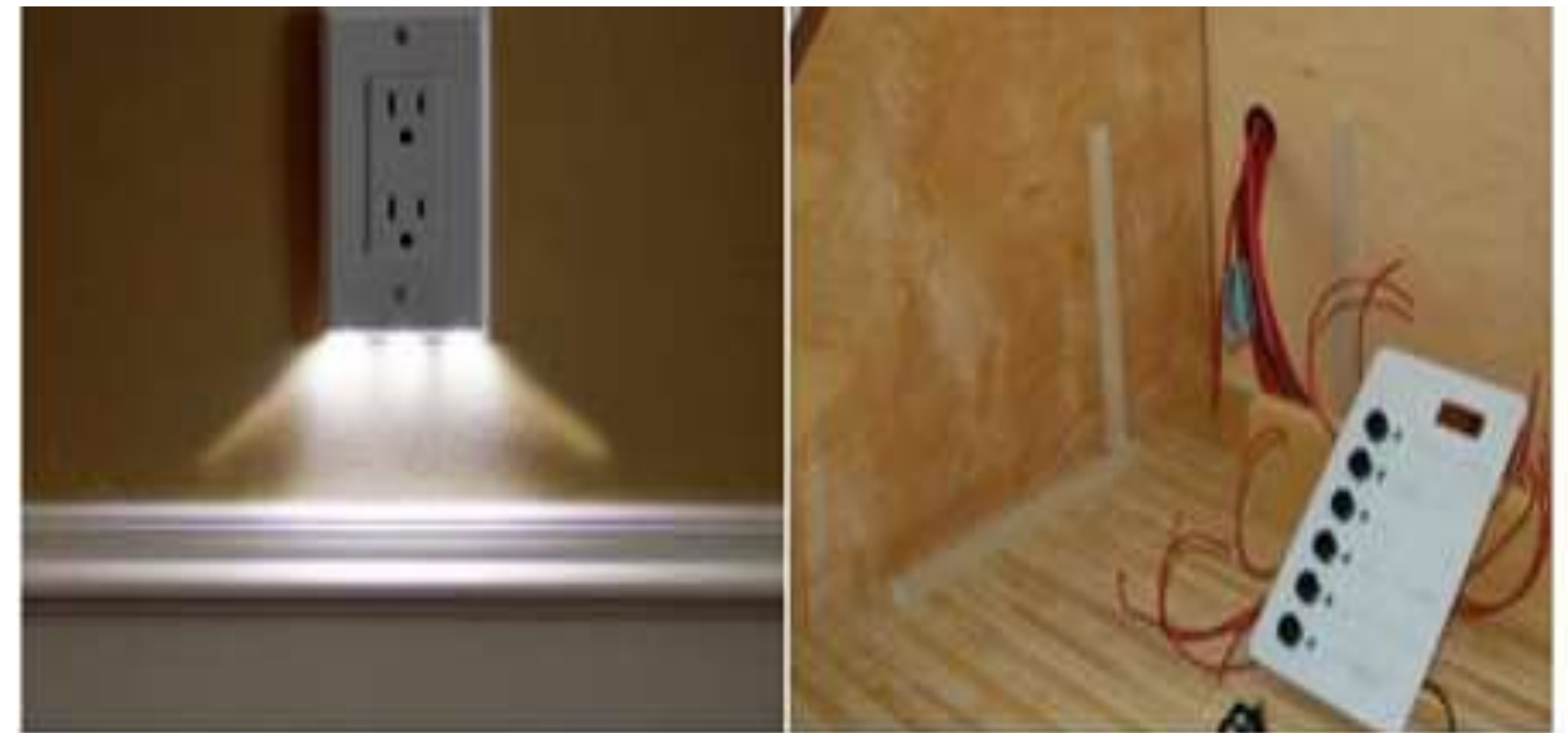
Concealed Conduit wiring