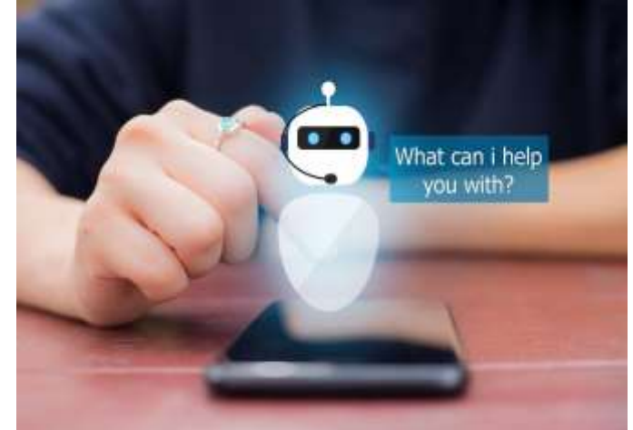
Mobile voice assistants