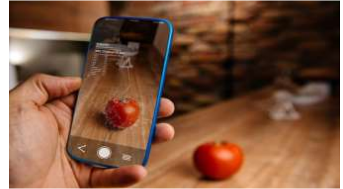
Mobile device AR

2. Furthermore, accessibility is becoming more crucial in UI/UX design. With the increasing use of technology by individuals with disabilities, designers are emphasizing the need of building interfaces that are useable by everyone, regardless of their ability. This entails designing for various devices, settings, and situations, as well as ensuring that interfaces are not just simple to use but also easy to comprehend.