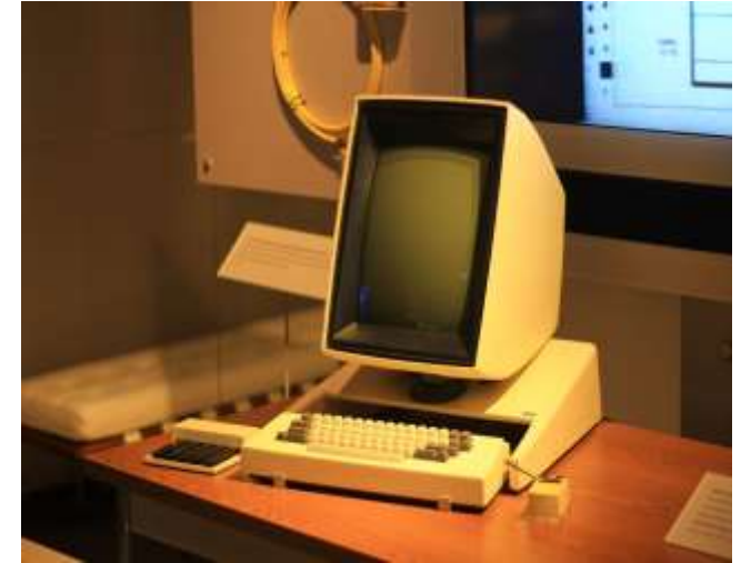
one of the first personal computers with a graphical user interface

3. The introduction of the World Wide Web in the 1990s was another major moment in the history of UI/UX design. With its hyperlinked sites and simple browsers, the web enabled anybody to access and exchange information online. This opened up a big potential for designers to develop user-centered websites that were both visually beautiful and easy to use.