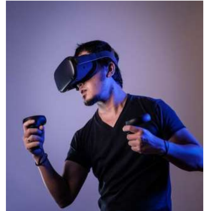
A man wearing a virtual reality headset

2.Designers are experimenting with new approaches to construct intelligent, conversational interfaces that can comprehend and respond to users' natural language as voice assistants such as Alexa and Siri become more popular, as well as chatbots.