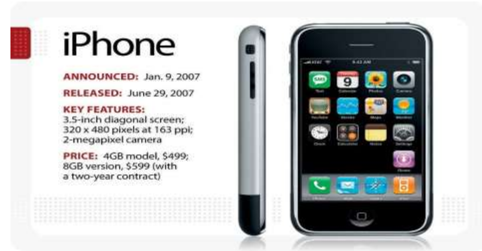
The first iPhone from 2007

2.Some of the key figures and influencers in the field of UI/UX design include people like Steve Jobs, who popularized the concept of “user-centered design” at Apple, Don Norman, who coined the term “user experience” and has written extensively on the topic, and Jakob Nielsen, who is known for his research on website usability.