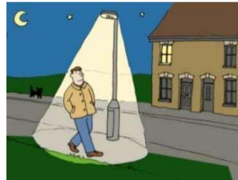
The meaning of the idiom

An idiom is a group of words that have a special meaning when used together. The meaning of the idiom is different from the meaning of the individual words. Shakespeare used and invented lots of idioms.